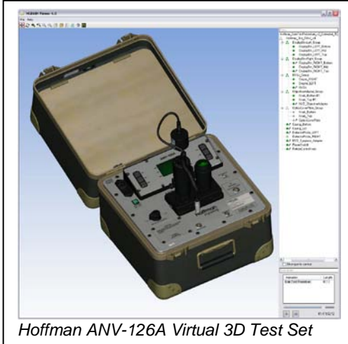
Hoffman ANV-126A Virtual 3D Test Set

Inadequate training and improper handling of NVIS equipment, such as Night Vision Goggles (NVGs), can jeopardize lives, operational readiness and mission goals. The NVG Computer-Based Training (CBT) was designed to help optimize NVG training support programs for operators and maintainers. It is an essential tool to help users build and maintain the critical foundation of knowledge concerning NVG handling required to respond to operational challenges. The self-paced instruction modules that can be accessed from home, the classroom or in the field, to provide just-in-time, on-the-job operations and maintenance support for NVGs, when and where needed.